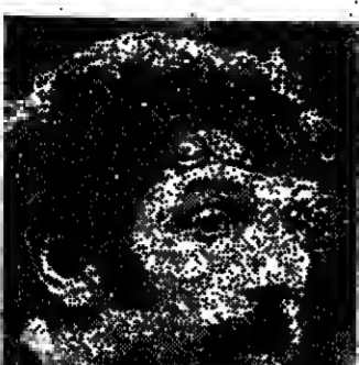
Mourie: successful author